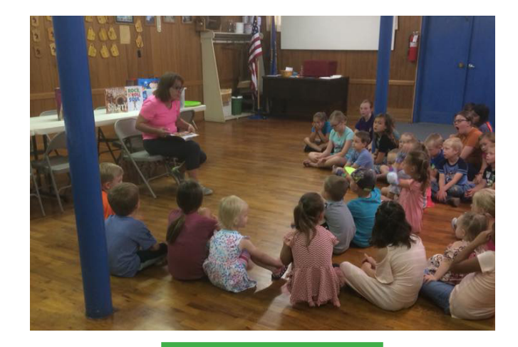
Share a Story