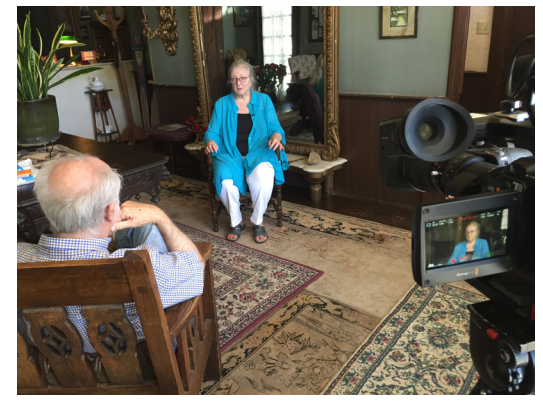
Cimarron, KS - One of the many communities we covered on our local production of Traveling Kansas !

In addition to programming, our services include the distribution of books to children, as well as schools and libraries across central and western Kansas. Smoky Hills PBS also hosts many educational and